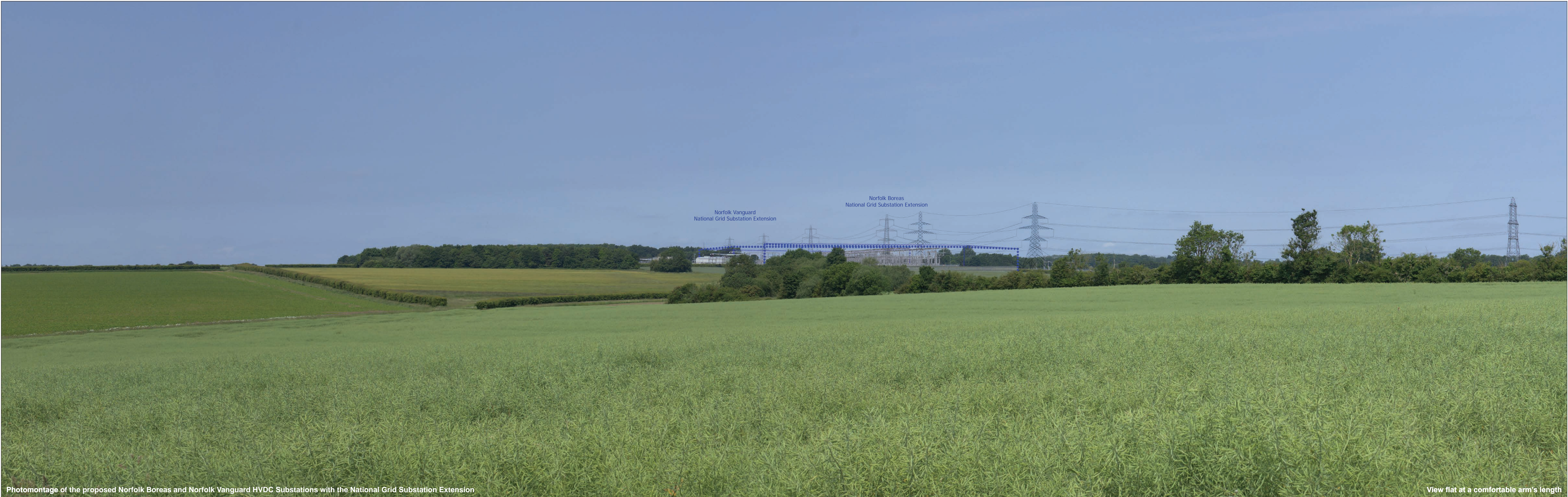
Photomontage of the proposed Norfolk Boreas and Norfolk Vanguard HVDC Substations with the National Grid Substation Extension