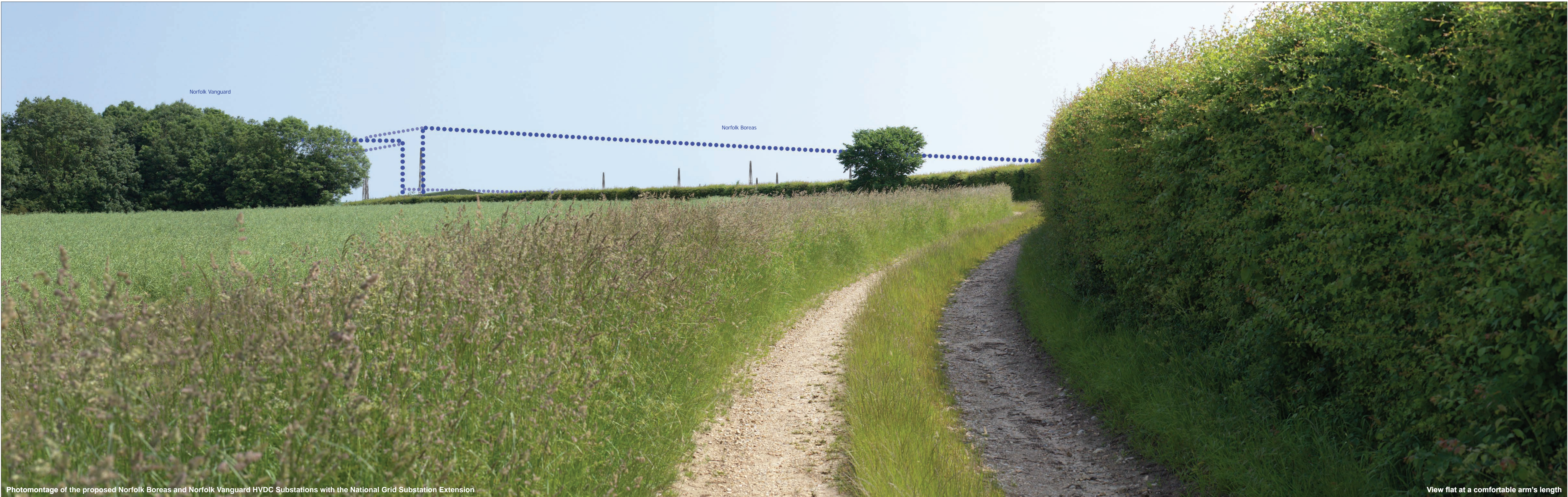
Photomontage of the proposed Norfolk Boreas and Norfolk Vanguard HVDC Substations with the National Grid Substation Extension