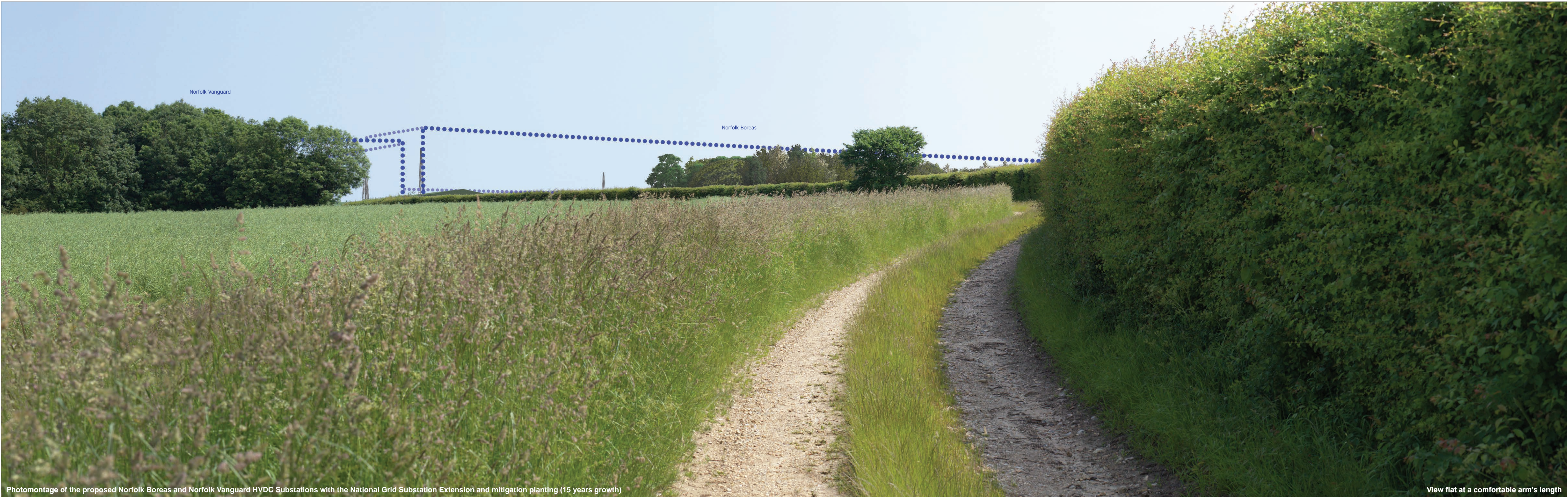
Photomontage of the proposed Norfolk Boreas and Norfolk Vanguard HVDC Substations with the National Grid Substation Extension and mitigation planting (15 years growth)