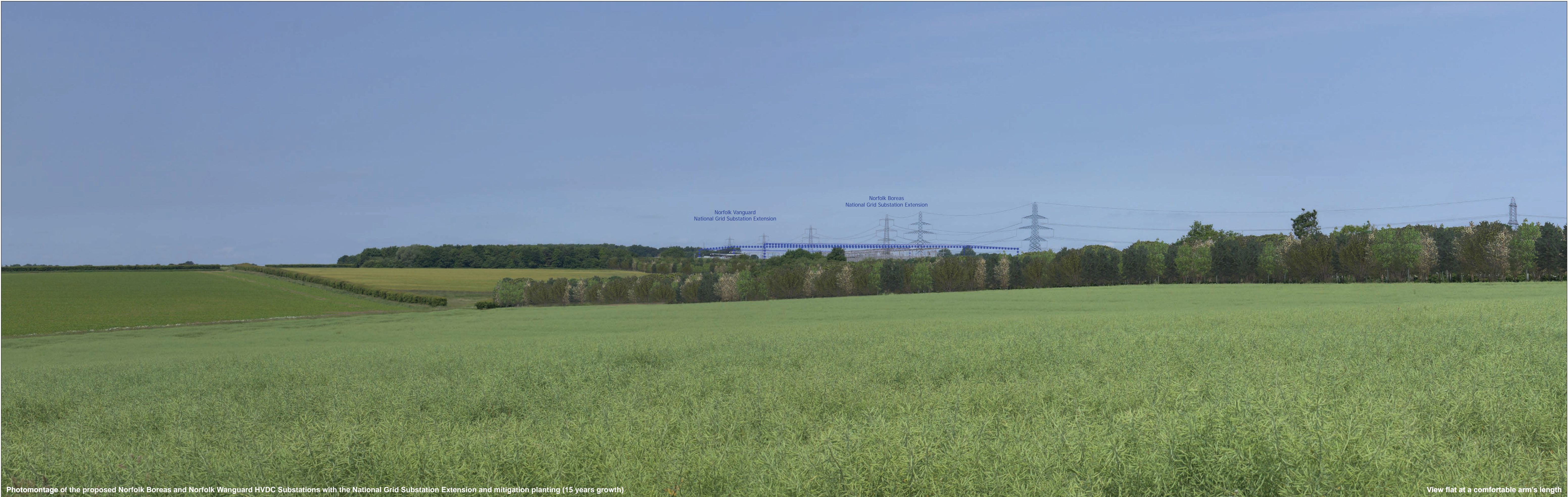
Photomontage of the proposed Norfolk Boreas and Norfolk Vanguard HVDC Substations with the National Grid Substation Extension and mitigation planting (15 years growth)