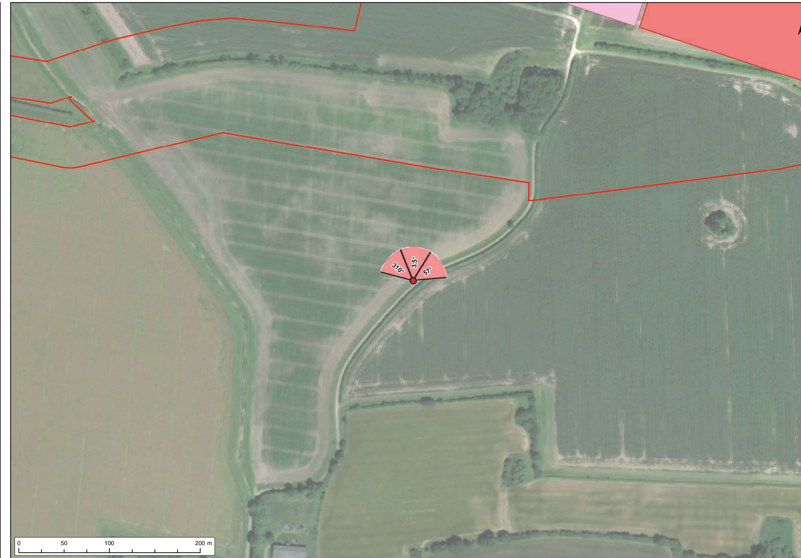
Viewpoint Location Plan (53.5 Degree View) Scale: 1:2,500